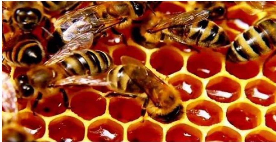
Figure 1. Honey on the honeycomb