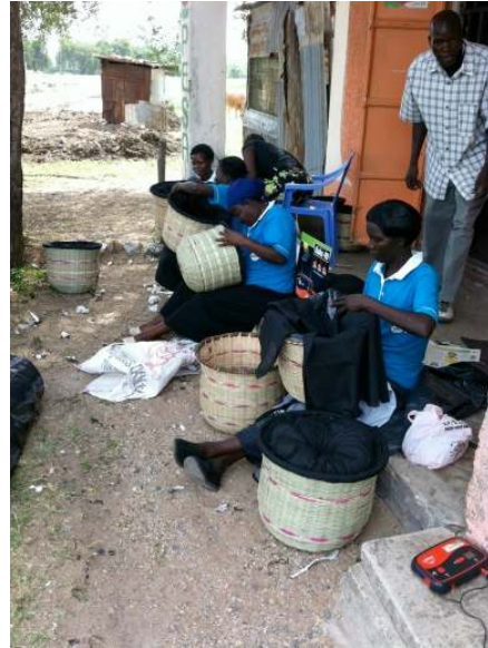
Production of fireless cookers by a local women initiative in Kisumu, Kenya, Sep. 3013.

A fireless cooker can take 50 per cent of the daily cooking tasks – or even more.